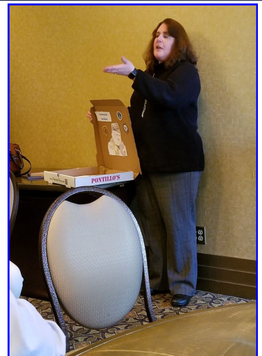
Example Pizza Box

Please sign up for interview times by contacting Bill Rahn ASAP.